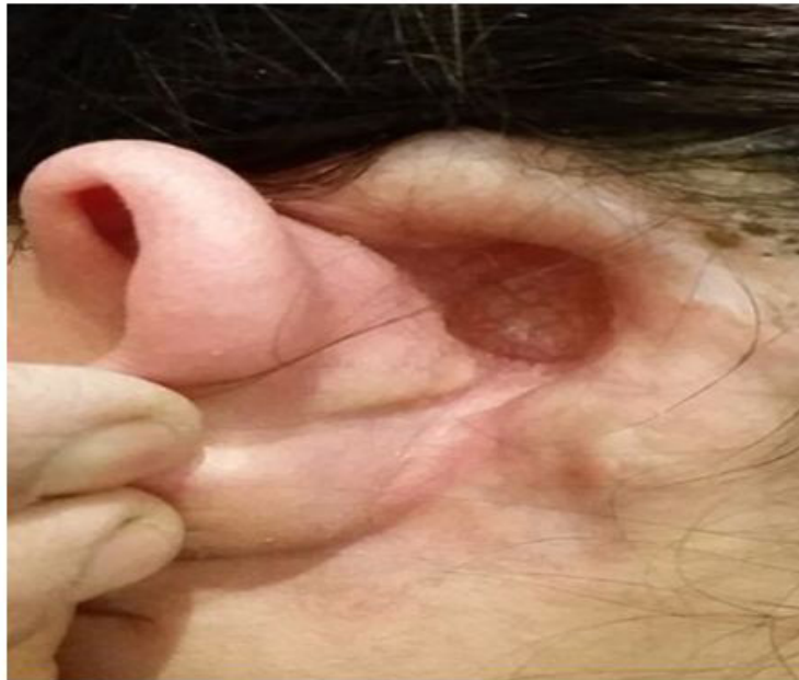
Figure 3: Rare complication. Complete resorption of the grafted cartilage resulted in an exposed mastoid cavity

The meatuses were aesthetically accepted in all patients, as they were not too wide (mean of the external canal volume = 1.3 ml \pm 0.7ml), except in one patient who was interested as there was a complete resorption of the graft material, resulting in wide canal, exposed mastoid cavity with ear discharge (the same problems of CWD mastoidectomy without obliteration) (Figure 3).