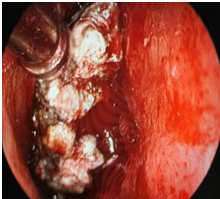
Figure 2: A rigid nasoendoscopy view showing the obstructed right nasal cavity with rhinoliths

The per operative exploration noted several stones presented in a giant rhinolith occupying the whole nasal cavity.