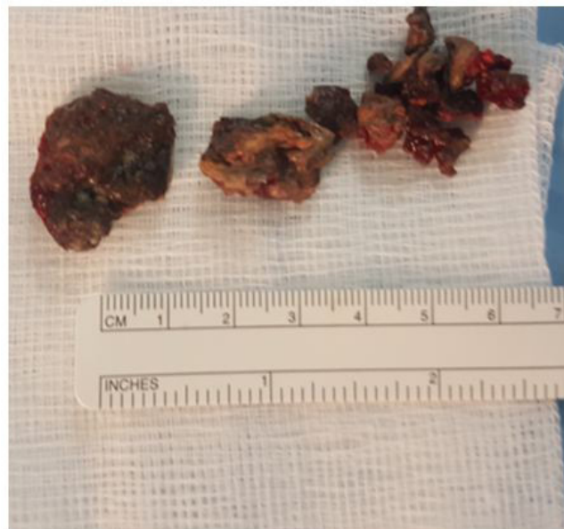
Figure 4: An endoscopic verification showing the complete emptiness of the right nasal cavity after extraction of the rhinoliths

A clinical evaluation after 3 months showed the regression of the symptoms with no sign of nasal obstruction.