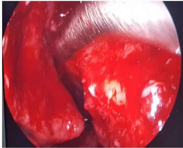
Figure 3: Image of extracted rhinoliths

Histopathology examination revealed fragments of non-viable tissue with areas of calcification suggestive of rhinolith.