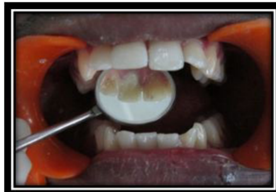
Figure 10: Post-operative palatal view