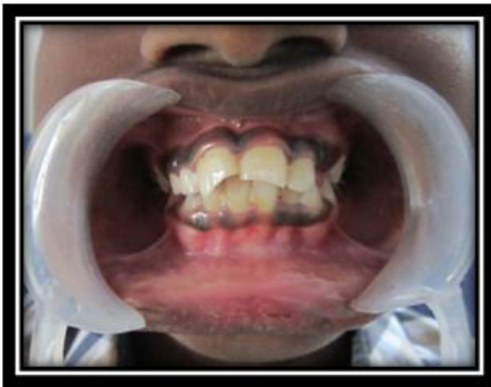
Figure 1: Pre-operative view

(Figure 2). Clinical & radiographic examination revealed uncomplicated tooth fracture (Ellis class II) with no evidence of pulpal exposure, mobility or root fracture of 21 & Ellis class III fracture of 11(Figure 3). The treatment plan of choice was to reattach dental fragment of the 21 and root canal treatment of 11. The fragment was tried in intraorally to check for proper positioning and fit with the fractured coronal structure.