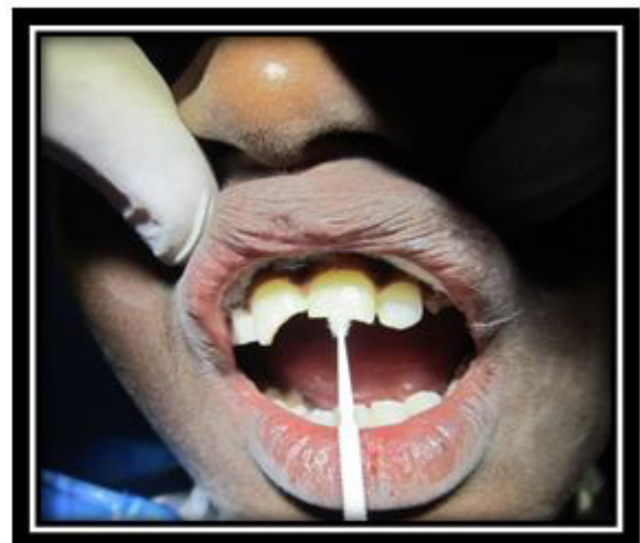
Figure 5: Application of bonding agent