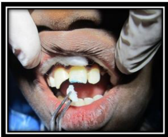
Figure 4: 37% phosphoric acid gel was applied onto the tooth & the fragment

The operating field was isolated and the fractured surfaces of the tooth & fragments were cleaned with treated with 37% phosphoric acid gel for 30 seconds, followed by rinsing (Figure 4). The adhesive system (Prime and Bond NT, Dentsply) was then applied to the etched surfaces & light cured (Figure 5). Flowable composite (Ivoclar vivadent) was applied to both fragment and tooth surfaces. When the original position had been reestablished, stable finger pressure was applied on the fragment, excess resin was removed and the area was light-cured. Additional composite was placed after the first cure in order to restore any undercountoured areas. Margins were properly finished with diamond burs and polished with a series of Sof-Lex disks (3M ESPE) and diamond polishing paste. The immediate postoperative view shows adequate esthetic results with restored functionality (Figure 6).