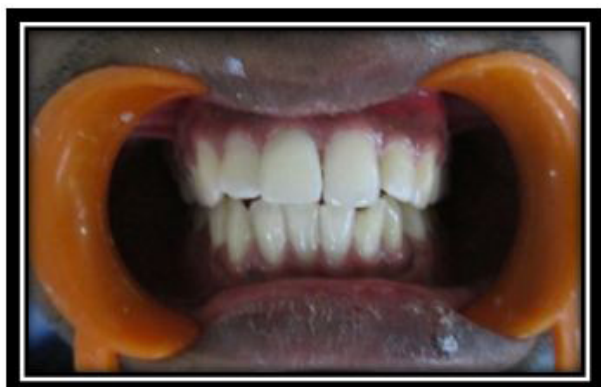
Figure 9: Post-operative view

The fragment was then adapted to the tooth and fit was verified. Resin cement (Multilink speed ; ivoclar Vivadent AG, Schaan, Liechtenstein) was applied to the fractured fragment, the post and the fractured tooth and the fragment was carefully repositioned. Excess cement was carefully removed from the margins and final curing was done for 40 seconds. Margins were properly finished. The immediate postoperative view shows adequate esthetic results with restored functionality (Figures 9 and 10).