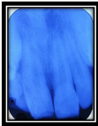
Figure 3: IOPA of 11 & 21

The operating field was isolated and the fractured surfaces of the tooth & fragments were cleaned with treated with 37% phosphoric acid gel for 30 seconds, followed by rinsing (Figure 4). The adhesive system (Prime and Bond NT, Dentsply) was then applied to the etched surfaces & light cured (Figure 5). Flowable composite (Ivoclar vivadent) was applied to both fragment and tooth surfaces. When the original position had been reestablished, stable finger pressure was applied on the fragment, excess resin was removed and the area was light-cured. Additional composite was placed after the first cure in order to restore any undercountoured areas. Margins were properly finished with diamond burs and polished with a series of Sof-Lex disks (3M ESPE) and diamond polishing paste. The immediate postoperative view shows adequate esthetic results with restored functionality (Figure 6).