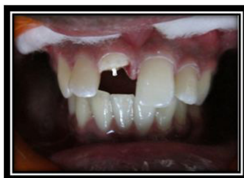
Figure 8: Cemented fiber post

The day after completion of the endodontic treatment, Post space preparation was done with the corresponding drill to receive a prefabricated glass fiber post [Reforpost, Angelus]. The prefabricated post was checked in the canal for adaptation. Self-adhesive dual cure resin cement (Multilink speed; Ivoclar Vivadent AG, Schaan, Liechtenstein) was used for luting fiber post & reattaching coronal fragment. Resin cement was delivered from the automix tip into the post space & on the fiber post. The post was then seated into the canal and the excess cement was removed. Polymerization was done for 40 seconds through the post (Figure 8).