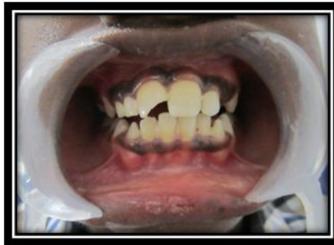
Figure 6: Post-operative view