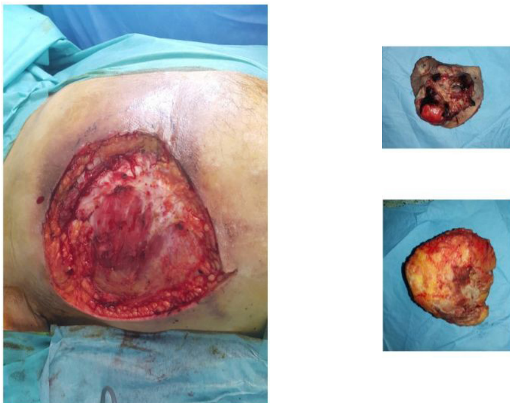
Figures 3: Wide local surgical resection of the tumor removed in bloc with resection of the clavicular portion of major pectoralis

The final pathology demonstrated a slightly differentiated sarcoma measuring 10.5* 10 cm. Furthermore, the complementary immune-histo-chemistry report was in favor of a Darier-Ferrand dermatofibrosarcoma with transformation zone of fibrosarcoma.