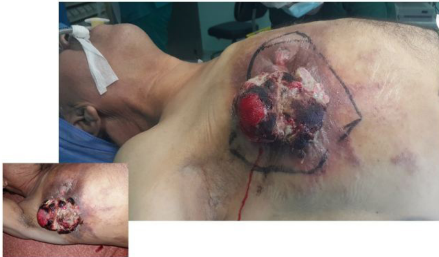
Figures 1: Larger tumor recurrence in the same site with inflammatory signs and necrosis on the skin