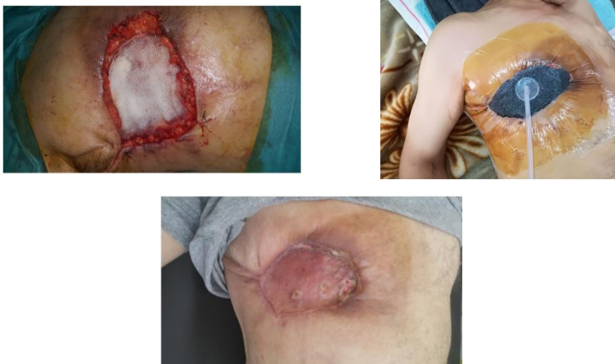
Figures 4: Good Scar healing after Negative pressure wound therapy and auto log cutaneous reconstruction

The patient underwent hyperbaric oxygen therapy (20 session) followed by negative pressure wound therapy for 7 days. Then, he was later called for reconstruction surgery by auto log cutaneous transplant (Figure 4).