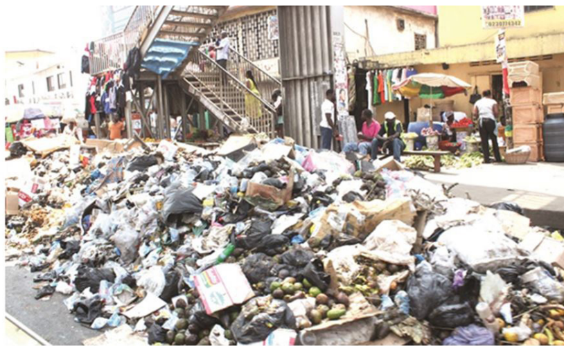
Figure 2: Uncollected waste seen in a market in Accra

Over the years, there were some periods when effective waste management is seen to be on going at various places but mostly for short time and in occasion. The problem appears to be at the final treatment or disposal point. The major final disposal method is landfill sight. Apparently when a sight get filled-up, locating a new one become a problem as nearby communities almost always opposed to it. Major common issue is that most collection companies are not always sure of where to and how to dispose the waste eventually. Other disposal or treatment methods being employed by various sectors and institutions are incineration, open burning, composting and recycling. Figure 3 show the solid waste management flow in Ghana.