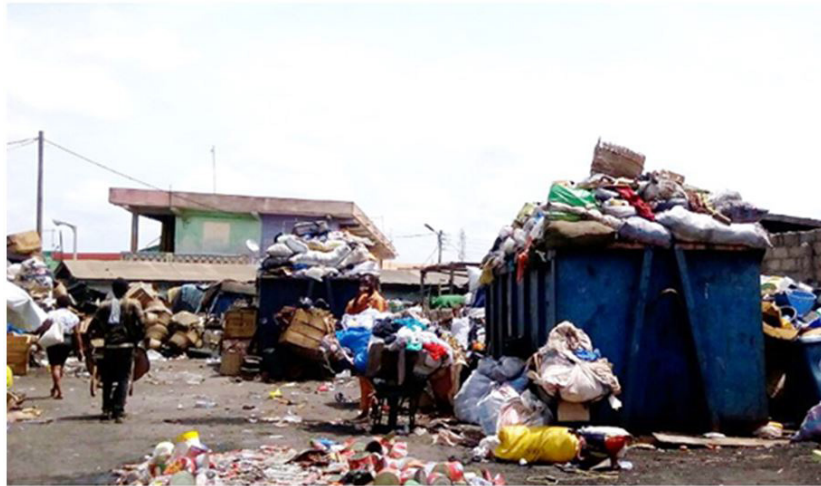
Figure 1: Sight of solid waste not collected