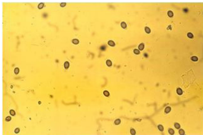
Figure 1: Fungal spores mimicking the ova of Clonorchis sinensis