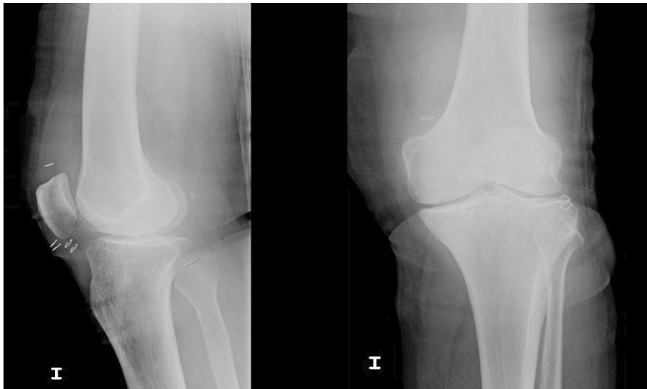
Figure 1: Lateral and anteroposterior X-ray view of the knee post-arthroscopy

infection is detected. Blood analysis shows anemia manifestations as well as acute renal failure, which associated to the infection of the surgical wound advise of the need to readmit the patient for further study and an adequate treatment.