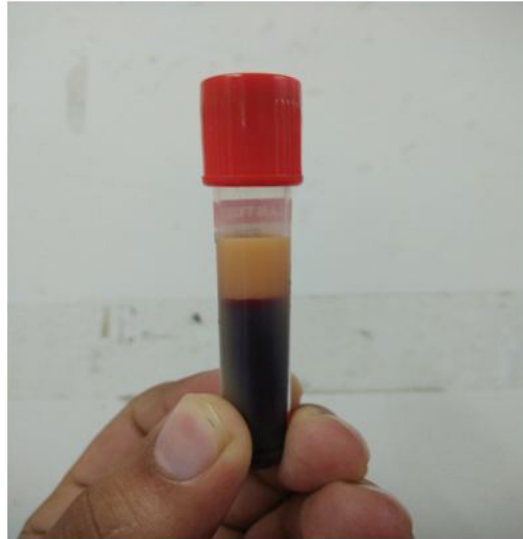
Figure 1: Milky white serum secondary to hypertriglyceridemia

In view of past history of dyslipidemia with normal amylase and USG suggestive of bulky pancreas, the possibility of HTG induced acute pancreatitis was kept. Lipid profile revealed very high serum triglyceride (TG) 4049 mg/dl (normal : less than 150 mg/dl), high cholesterol level 879 mg/dl (normal : less than 200 mg/dl) , high very low- density lipoprotein (VLDL) 130 mg/dl (normal 2-30 mg/dl) normal low-density lipoprotein 59 mg/dl and low high- density lipoprotein (HDL) 28 mg/dl (normal for men : 50-59 mg/dl). Serum was milky white after being left to stand overnight (Figure 1). Bedside index of severity in acute pancreatitis score was 3.