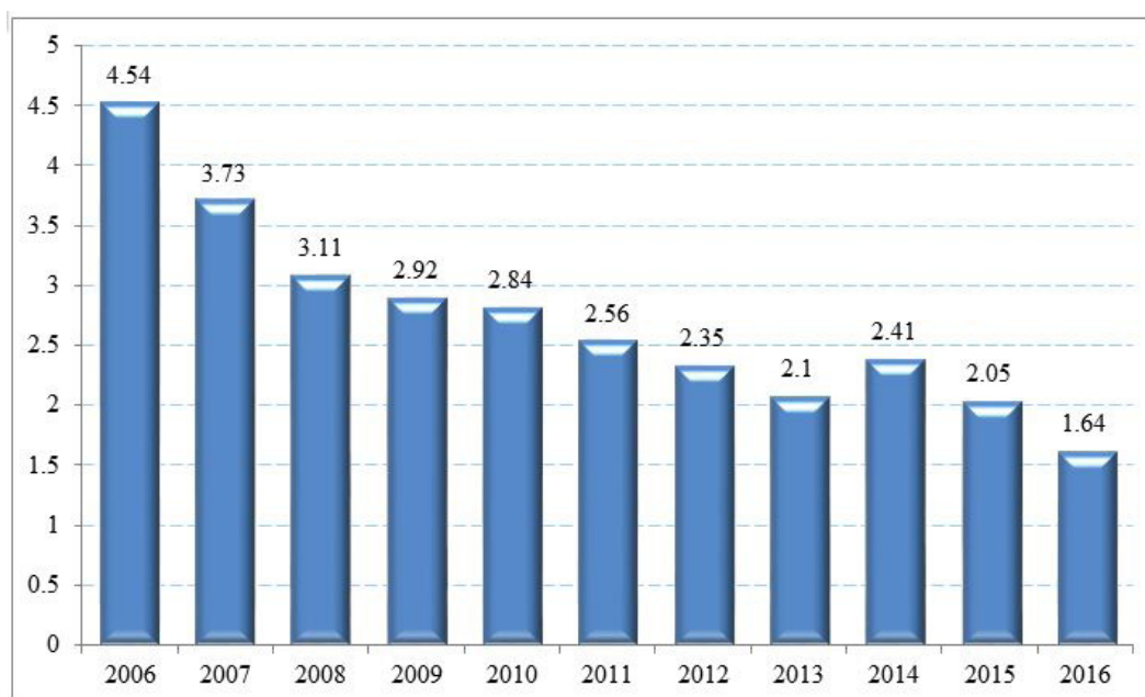
Figure 1: Dynamics of primary disease of children and adolescents (per 100,000 population of corresponding age) patients in Russia

The dynamics of primary disease of children population (first diagnosis per 100,000 population of corresponding age) with CHC in the Russian Federation for the period 2006-2016 is presented in Figure 1. There is a decrease by more than 2.5 times (Figure 1).