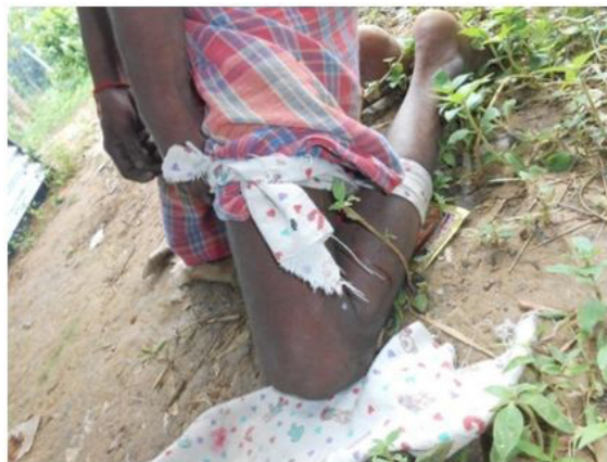
Figure 4: Victim hanged with tied-leg on kneeling position to prevent support from any nearby object. This was done to ensure that he does not attempt to rescue himself