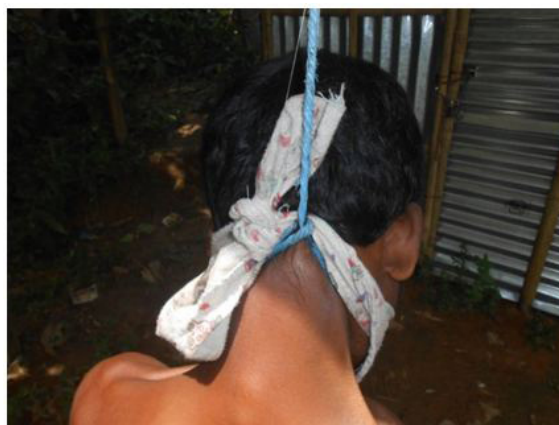
Figure 5: Tied-mouth from back showing slip knot of nylon rope (hanging material)