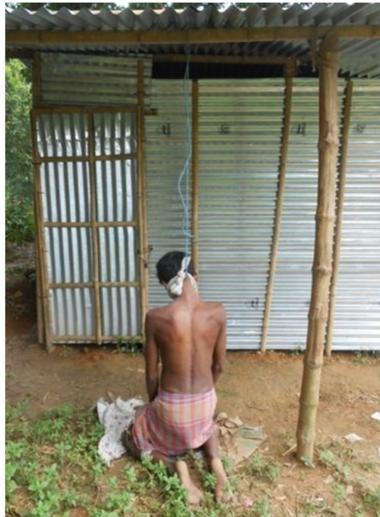
Figure 2: Victim hanged on kneeling with a nylon rope from a bamboo beam. The total length of the rope is 220 cm and the length between the suspension point and the ligature knot around the neck is 100 cm, the rest part of the rope being freely suspended from the suspension point

The unusual methods adopted by the victim are shown in Figure 2-6.