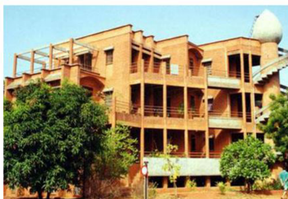
Figure 4: Vikas Community on 4 floors

Cynics may question the need to reintroduce what they believe to be an inferior building material best left in the past. Earth when used in buildings is recognized as having a number of remarkable characteristic features for the realization of sustainable development. The use of earth has grown rapidly in the developing nations. In countries with no industrialized means, earth remains the main, if not the essential building material for necessary access to development. Earth in modern architecture represents a considerable improvement over traditional earth building technique [9].