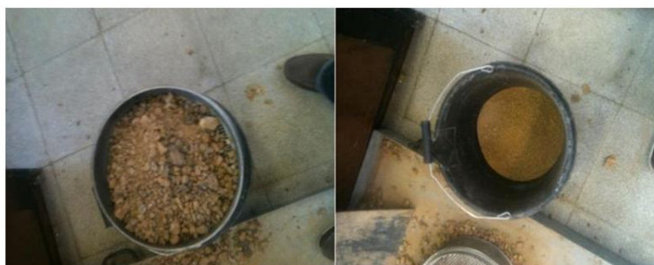
Figure 3: Crushed soil placed into sieve and soil after it has been sieved

First of all, it is necessary to find the right (workable) kind of soil. Sandy, but not all sand (between 50% and 75% is ok) with a mixture of clay as a binding agent [1,2]. You mustn't have too much clay either, or the finished wall will shrink and crack. The first construction step should be the sieving of the soil through a slanted screen of 1" mesh hardware cloth to separate out any big stones, roots, etc. Spread a tarpaulin over the screened dirt to protect it from precipitation (if the soil contains more than 10% moisture it will puddle, not compress) [2]. When you make a ball of earth in your hand it should hold its shape but break and scatter when dropped (Figure 3).