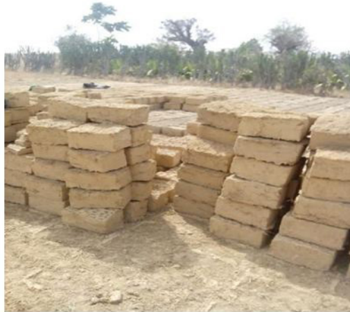
Figure 1: Picture showing adobe blocks