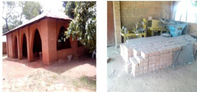
Figure 9: Picture showing perspective view of the building and internal view of workshop area

The choice of this historical building as a case study was motivated by its durability and natural aesthetical appearance. The building is currently not used for production of compressed earth bricks because of the poor maintenance of production machines. The design is aimed at producing an alternative learning and leisure environment (Figure 9).