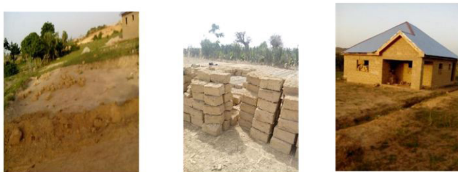
Figure 7: Picture showing area where earth was excavated for molding of blocks, the molded blocks and the built house