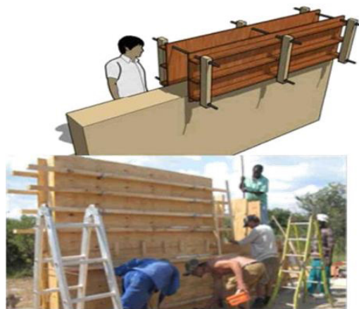
Figure 2: Showing ways of coupling framework for rammed earth structure

or mechanically (motorized). These bricks are moulded in different forms e.g. solid blocks, hollow blocks, interlocking blocks, perforated blocks, etc.