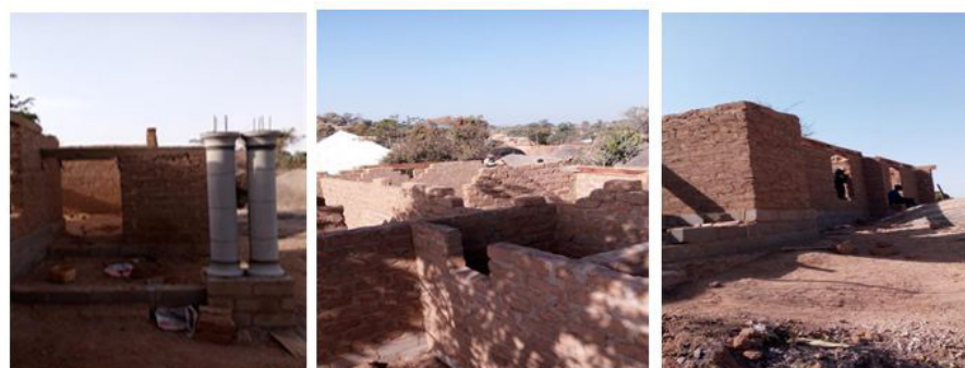
Figure 8: Picture showing columns finished with built cement paste, building at window level, foundation wall with sandcrete blocks and framework of lintel