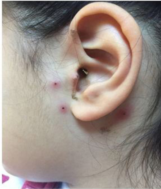
Figure 1: The appearance of the left ear. The hyperemic loci of the entrance of leeches are visible

patient was hospitalized, immediate intravenous (IV) antibiotics ( Ceftriaxone 2x 750 mg ) and anti-inflammatory-analgesic agents were administered for 10 days. Following the IV therapy, the patients' symptoms relieved, she was discharged and oral Cefuroxime axetil 2x 250 mg for 10 days was prescribed.