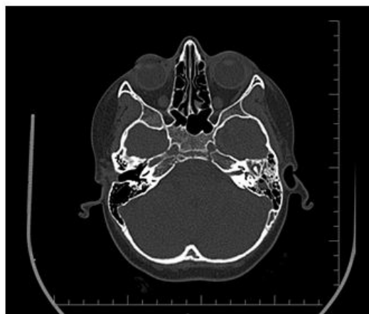
Figure 3: The axial CT image of the patient