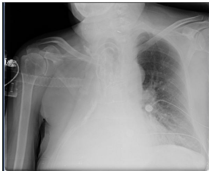
Figure 2: Chest X-ray anterior -posterior view shows successful tracheostomy without any complication