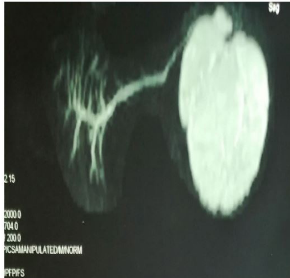
Figure 1: MR sialography showing sialocele

50 year old gentleman presented with symptoms of swelling on left side of cheek for 2 weeks duration. On eliciting history, it was noted that patient developed this swelling soon after a road traffic accident, when he sustained blunt injury over his face. He was initially evaluated in nearby hospital and referred to us for further management. At presentation, patient had soft, cystic swelling in left side of cheek and it was non-tender, non-compressible and it showed brilliant Trans illumination. Aspiration of swelling revealed clear fluid which upon biochemical analysis revealed presence of salivary amylase. Intra-orally there was scarring over parotid orifice area and parotid duct orifice could not be visualized. A clinical diagnosis of parotid sialocele was made and MRI of parotid region and MR sialogram was done which confirmed the presence of sialocele with evidence of terminal duct injury (Figure 1). Parotid gland and proximal portion of duct appeared normal.