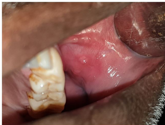
Figure 5: 1 month post-operative picture showing patent and well healed Parotid orifice