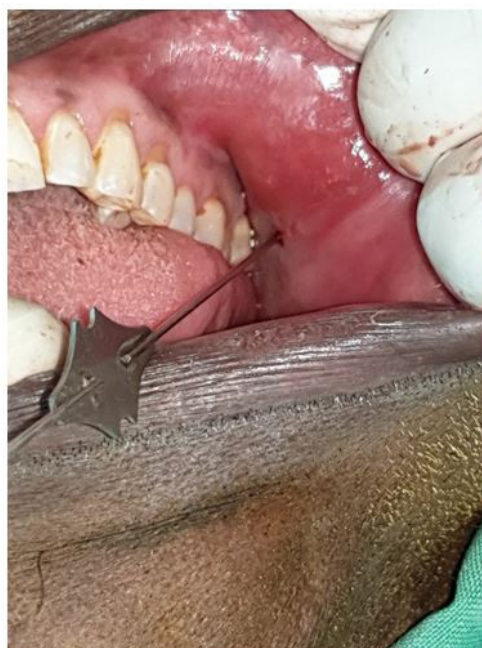
Figure 2: Dilatation being done with lacrimal probe

Patient was taken up for recanalization and stenting of terminal portion of parotid duct. Intra orally parotid duct orifice was identified after probing with lacrimal probe. Ductal dilatation was done with lacrimal probe till size 6 (Figure 2). Endoscopic visualisation of sialocele cavity was done with ureteric endoscope of size 1.2 mm. Level of ductal laceration was found to be near the parotid orifice and scope could not be passed easily into the proximal portion of duct. Ureteric stent (DJ stent) of size 1mm was kept as stent (Figure 3). Outer end of stent was fixed to buccal mucosa. Free flow of saliva was noted in post-operative period. Pressure bandage was applied externally in cheek over area of sialocele. Stent was removed after 4 weeks period. After stent removal, ductal orifice was found to be patent and there was clear flow of saliva through the orifice.