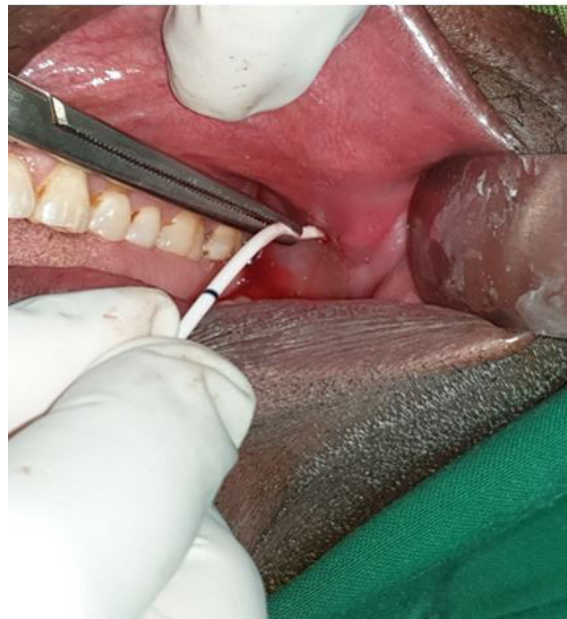
Figure 3: DJ stent insertion