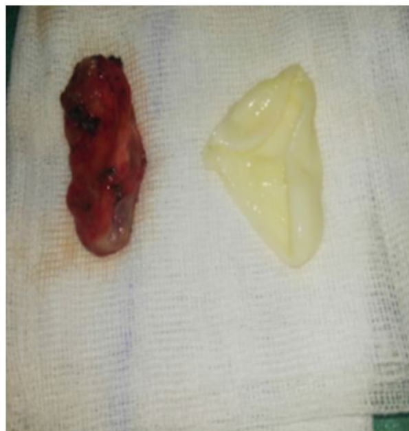
Figure 3: surgical specimen showed the hydatid cyst